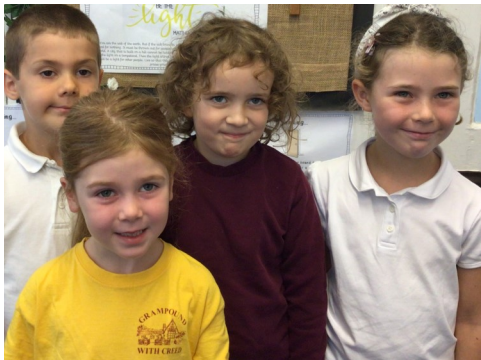
Lostledan School Council

This week, we ran our School Council 2023 2024 elections. It was a pleasure to hear the children's manifestos which were presented to the classes with courage and pride. Congratulations to the following pupils who have been elected this year. We look forward to the difference you will make to ensure our school is a happy, safe and nurtur-