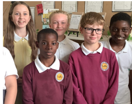
Kwilky School Council